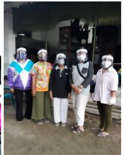
Our dedicated volunteers