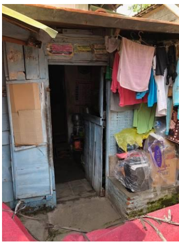
New mattresses in small rooms and crammed houses